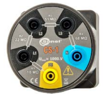
CS-1 cable simulator