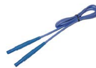
test lead with banana plugs; 1 kV; 4 ft (1.2 m); blue