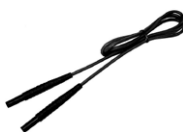
test lead with banana plugs; 1 kV; 4 ft (1.2 m); black