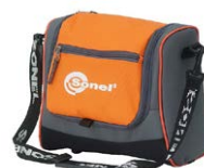
M-6 carrying case