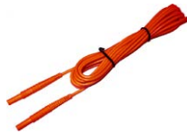
test lead 16.4 ft (5 m), red, 1 kV (banana plugs)