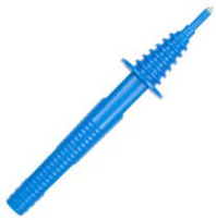
pin probe, blue 1 kV (banana socket)