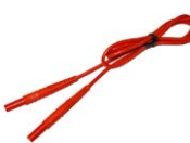
test lead with banana plugs; 1 kV; 4 ft (1.2 m); red